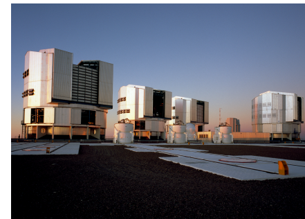
four wavefront sensors for the UTs in 2016