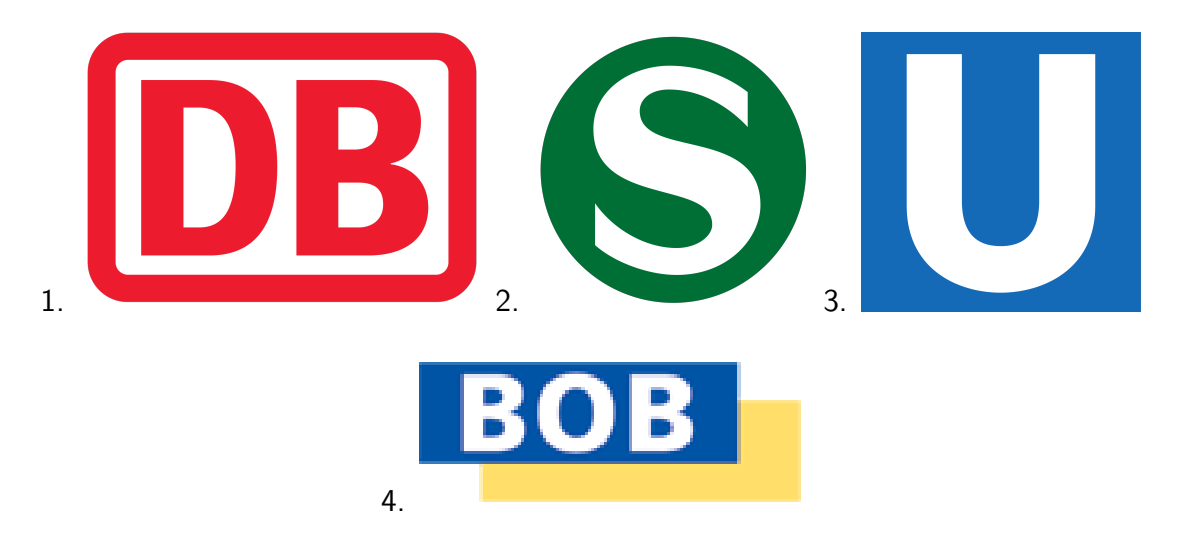
Figure 1: 1. Deutsche Bahn 2. S-Bahn 3. Unter-bahn 4. Bayerische Oberlandbahn

The main company that runs the train service in Germany is Deutsche Bahn. You will see the following symbols and logos throughout your travel through Germany.