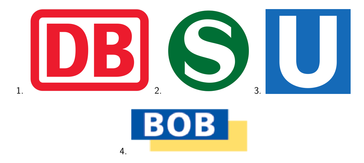
Figure 1: 1. Deutsche Bahn 2. S-Bahn 3. Unter-bahn 4. Bayerische Oberlandbahn

The main company that runs the train service in Germany is Deutsche Bahn. You will see the following symbols and logos throughout your travel through Germany.